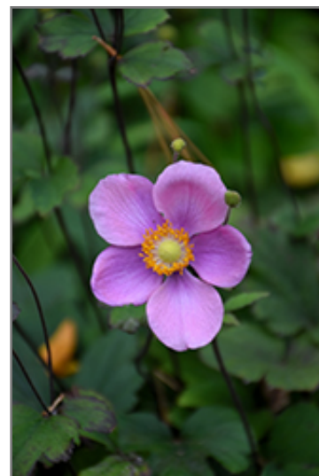
Lucky Charm Anemone flowers