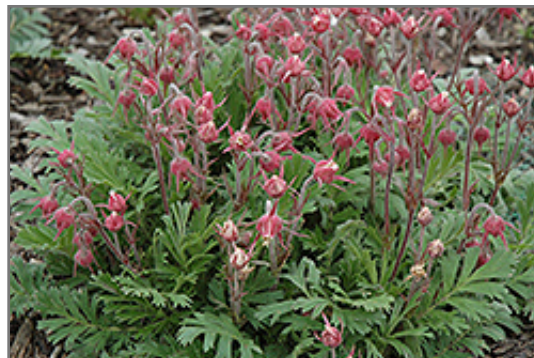
Prairie Smoke in bloom

Prairie Smoke is an herbaceous perennial with an upright spreading habit of growth. Its relatively fine texture sets it apart from other garden plants with less refined foliage.