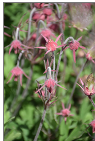
Prairie Smoke flower buds