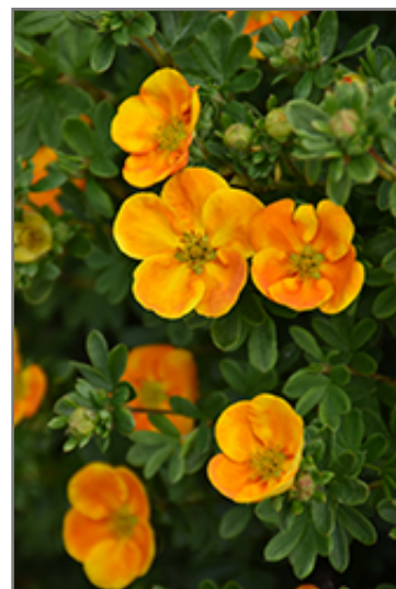
Mandarin Tango Potentilla flowers

Mandarin Tango Potentilla is recommended for the following landscape applications;