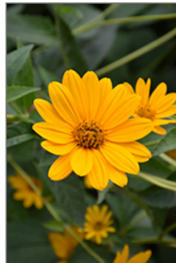
False Sunflower flowers

This is a relatively low maintenance plant, and is best cleaned up in early spring before it resumes active growth for the season. It is a good choice for attracting butterflies to your yard. It has no significant negative characteristics.