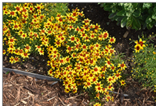
Sizzle And Spice Curry Up Tickseed in bloom