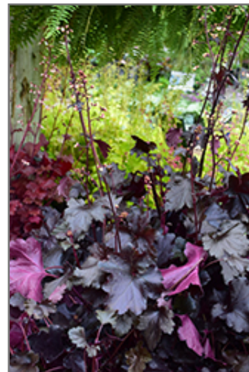
Black Pearl Coral Bells in bloom

This is a relatively low maintenance plant, and should be cut back in late fall in preparation for winter. It is a good choice for attracting hummingbirds to your yard. It has no significant negative characteristics.