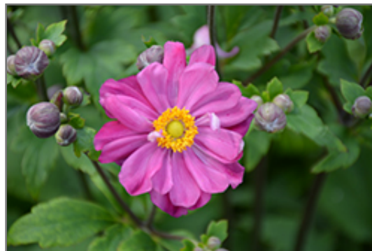
Curtain Call Deep Rose Anemone flowers

Curtain Call Deep Rose Anemone is a dense herbaceous perennial with an upright spreading habit of growth. Its relatively fine texture sets it apart from other garden plants with less refined foliage.