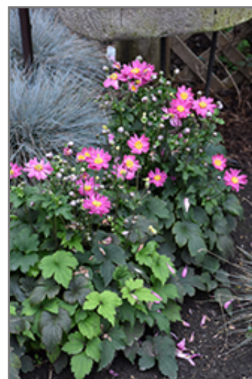
Curtain Call Deep Rose Anemone in bloom