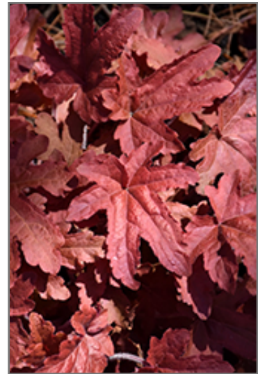
Fun and Games Red Rover Foamy Bells foliage

This is a relatively low maintenance plant, and should be cut back in late fall in preparation for winter. It is a good choice for attracting hummingbirds to your yard. It has no significant negative characteristics.