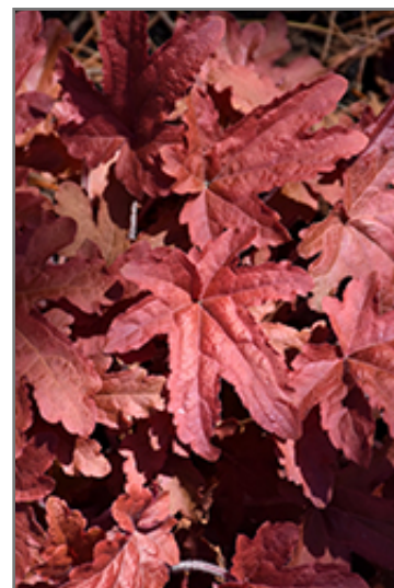
Fun and Games Red Rover Foamy Bells foliage

This is a relatively low maintenance plant, and should be cut back in late fall in preparation for winter. It is a good choice for attracting hummingbirds to your yard. It has no significant negative characteristics.