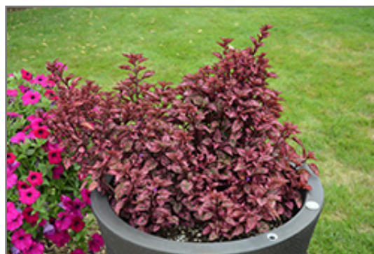
Hippo Rose Polka Dot Plant