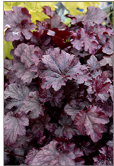
Plum Pudding Coral Bells foliage

This is a relatively low maintenance plant, and should be cut back in late fall in preparation for winter. It is a good choice for attracting hummingbirds to your yard. It has no significant negative characteristics.