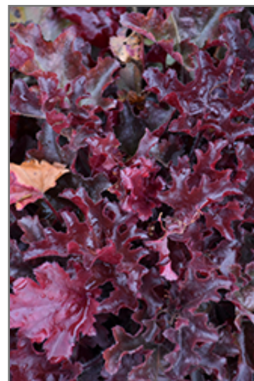
Dolce Cherry Truffles Coral Bells foliage