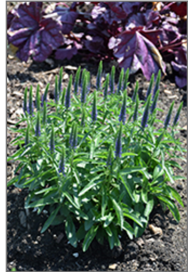
Magic Show Wizard of Ahhs Speedwell in bloom

Magic Show Wizard of Ahhs Speedwell is a fine choice for the garden, but it is also a good selection for planting in outdoor pots and containers. It is often used as a 'filler' in the 'spiller-thriller-filler' container combination, providing a mass of flowers against which the larger thriller plants stand out. Note that when growing plants in outdoor containers and baskets, they may require more frequent waterings than they would in the yard or garden.