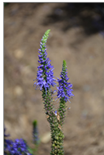
Magic Show Wizard of Ahhs Speedwell flowers