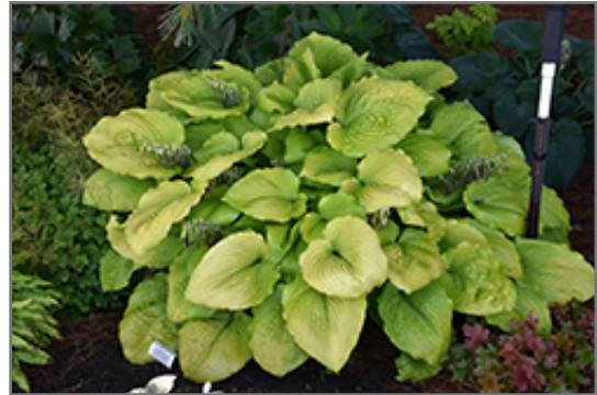
Shadowland Coast to Coast Hosta