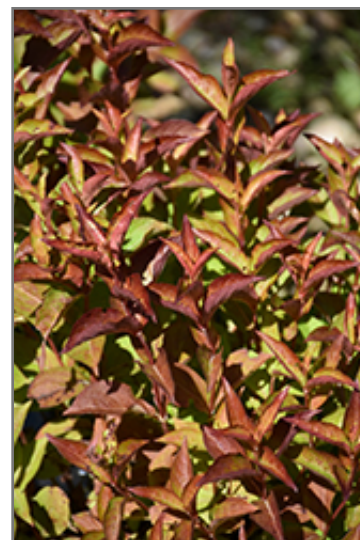
Date Night Strobe Weigela foliage

Date Night Strobe Weigela is recommended for the following landscape applications;