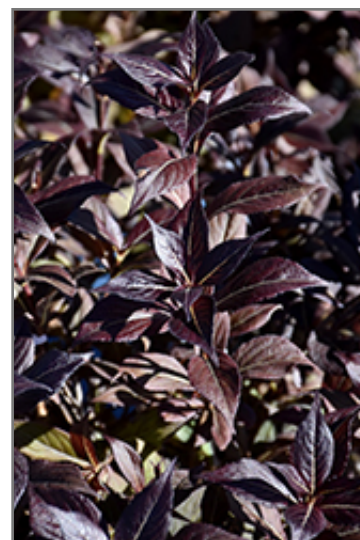
Date Night Stunner Weigela foliage