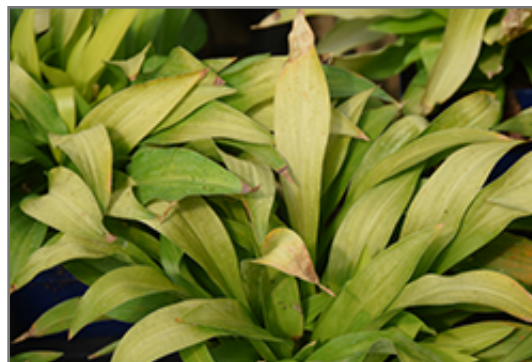
Munchkin Fire Hosta foliage