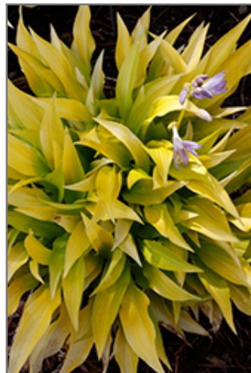
Munchkin Fire Hosta in bloom