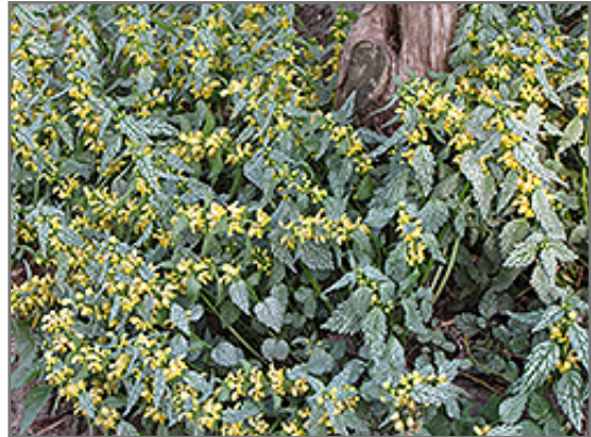
Hermann's Pride Yellow Archangel in bloom

This plant does best in partial shade to shade. It is an amazingly adaptable plant, tolerating both dry conditions and even some standing water. It is considered to be drought-tolerant, and thus makes an ideal choice for a low-water garden or xeriscape application. It is not particular as to soil type or pH. It is highly tolerant of urban pollution and will even thrive in inner city environments. This is a selected variety of a species not originally from North America. It can be propagated by division; however, as a cultivated variety, be aware that it may be subject to certain restrictions or prohibitions on propagation.