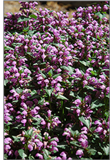
Beacon Silver Spotted Dead Nettle flowers

Beacon Silver Spotted Dead Nettle is a fine choice for the garden, but it is also a good selection for planting in outdoor pots and containers. Because of its spreading habit of growth, it is ideally suited for use as a 'spiller' in the 'spiller-thriller-filler' container combination; plant it near the edges where it can spill gracefully over the pot. Note that when growing plants in outdoor containers and baskets, they may require more frequent waterings than they would in the yard or garden.