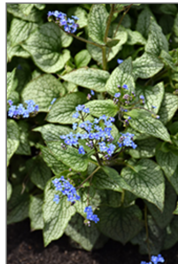
Queen of Hearts Bugloss flowers

Queen of Hearts Bugloss is recommended for the following landscape applications;