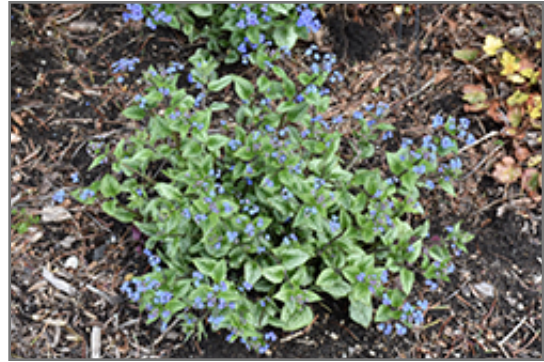
Queen of Hearts Bugloss in bloom

Queen of Hearts Bugloss will grow to be about 18 inches tall at maturity extending to 30 inches tall with the flowers, with a spread of 3 feet. When grown in masses or used as a bedding plant, individual plants should be spaced approximately 30 inches apart. It grows at a medium rate, and under ideal conditions can be expected to live for approximately 10 years. As an herbaceous perennial, this plant will usually die back to the crown each winter, and will regrow from the base each spring. Be careful not to disturb the crown in late winter when it may not be readily seen!