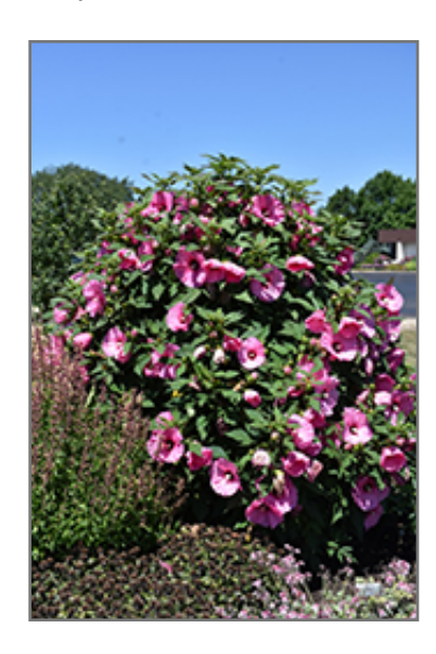
Summerific Candy Crush Hibiscus in bloom