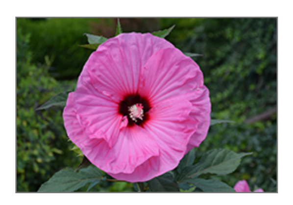
Summerific Candy Crush Hibiscus flowers

This plant will require occasional maintenance and upkeep, and should be cut back in late fall in preparation for winter. It is a good choice for attracting butterflies and hummingbirds to your yard. Gardeners should be aware of the following characteristic(s) that may warrant special consideration: