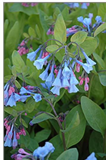
Virginia Bluebells flowers