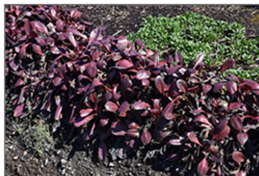
Flirt Bergenia foliage