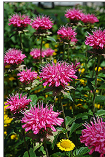
Marshall's Delight Beebalm flowers

Marshall's Delight Beebalm is recommended for the following landscape applications;