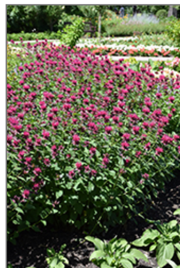
Raspberry Wine Beebalm in bloom