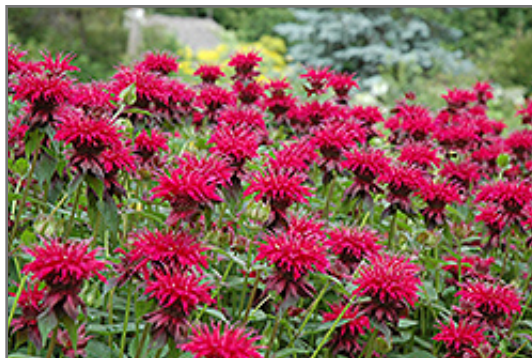
Raspberry Wine Beebalm flowers