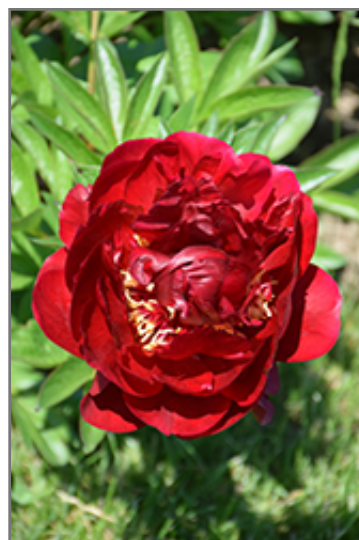
Buckeye Belle Peony flowers