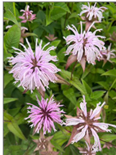
Eastern Beebalm flowers

This plant will require occasional maintenance and upkeep, and should be cut back in late fall in preparation for winter. It is a good choice for attracting bees, butterflies and hummingbirds to your yard, but is not particularly attractive to deer who tend to leave it alone in favor of tastier treats. Gardeners should be aware of the following characteristic(s) that may warrant special consideration;