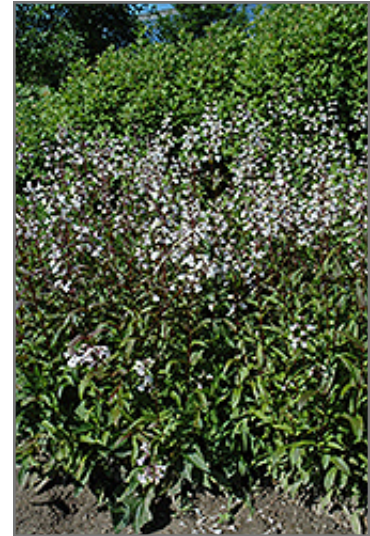
Husker Red Beard Tongue in bloom

Husker Red Beard Tongue is a fine choice for the garden, but it is also a good selection for planting in outdoor pots and containers. With its upright habit of growth, it is best suited for use as a 'thriller' in the 'spiller-thriller-filler' container combination; plant it near the center of the pot, surrounded by smaller plants and those that spill over the edges. Note that when growing plants in outdoor containers and baskets, they may require more frequent waterings than they would in the yard or garden.