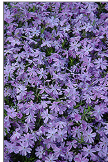
Emerald Blue Moss Phlox flowers

Emerald Blue Moss Phlox is recommended for the following landscape applications;