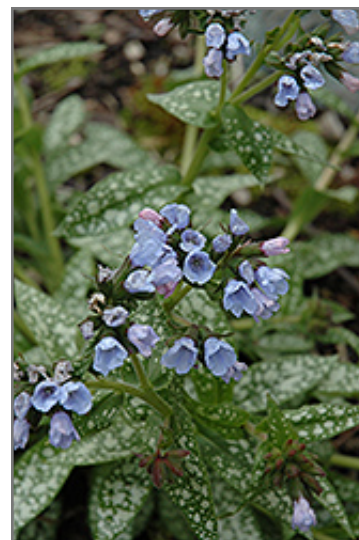
Roy Davidson Lungwort flowers