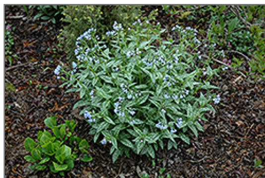
Roy Davidson Lungwort in bloom