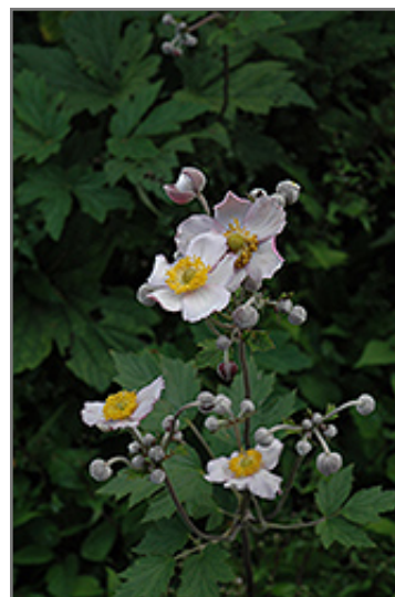
Grapeleaf Anemone flowers

Grapeleaf Anemone is recommended for the following landscape applications;