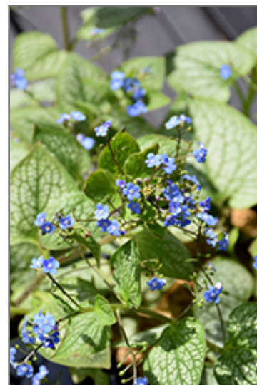
Jack of Diamonds Bugloss flowers

Jack of Diamonds Bugloss is recommended for the following landscape applications;