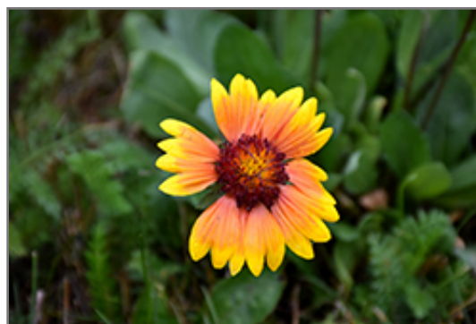
Blanket Flower flowers