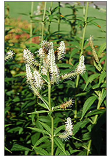
Culver's Root flowers