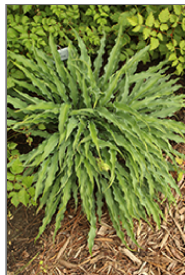
Silly String Hosta

Silly String Hosta is recommended for the following landscape applications;