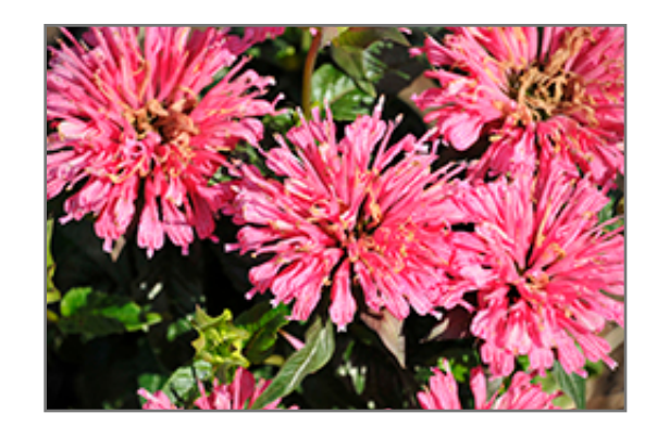
Pardon My Rose Beebalm flowers

Pardon My Rose Beebalm is an herbaceous perennial with a mounded form. Its medium texture blends into the garden, but can always be balanced by a couple of finer or coarser plants for an effective composition.