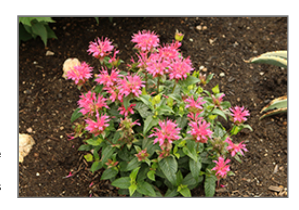
Pardon My Rose Beebalm in bloom

This plant will require occasional maintenance and upkeep, and should be cut back in late fall in preparation for winter. It is a good choice for attracting bees, butterflies and hummingbirds to your yard, but is not particularly attractive to deer who tend to leave it alone in favor of tastier treats. Gardeners should be aware of the following characteristic(s) that may warrant special consideration;