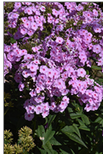
Luminary Opalescence Garden Phlox flowers