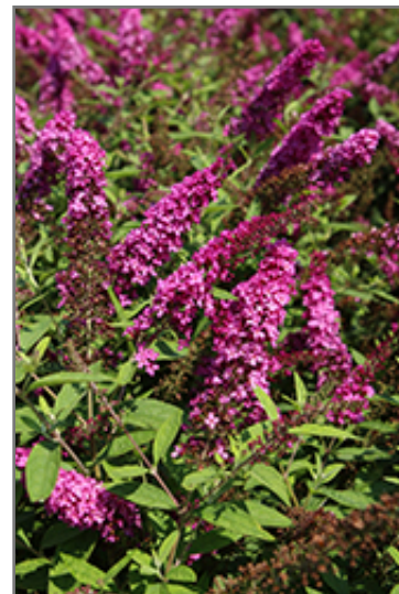
Lo & Behold Ruby Chip Butterfly Bush flowers

Lo & Behold Ruby Chip Butterfly Bush is a multi-stemmed deciduous shrub with a mounded form. Its average texture blends into the landscape, but can be balanced by one or two finer or coarser trees or shrubs for an effective composition.