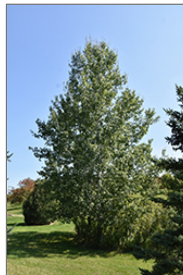
Trembling Aspen

Trembling Aspen is recommended for the following landscape applications;