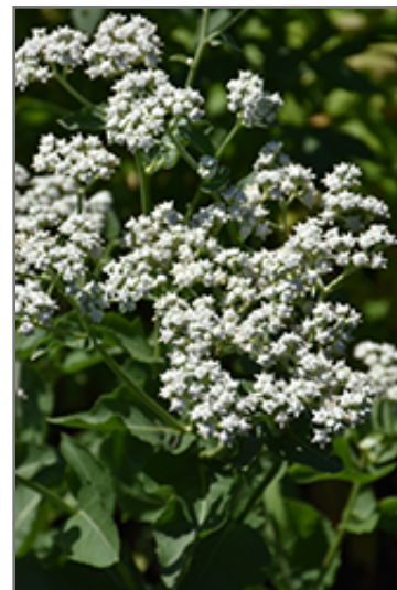
Wild Quinine flowers