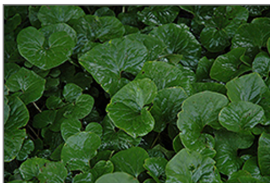
Canadian Wild Ginger