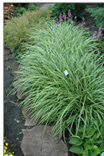
Ice Dance Sedge