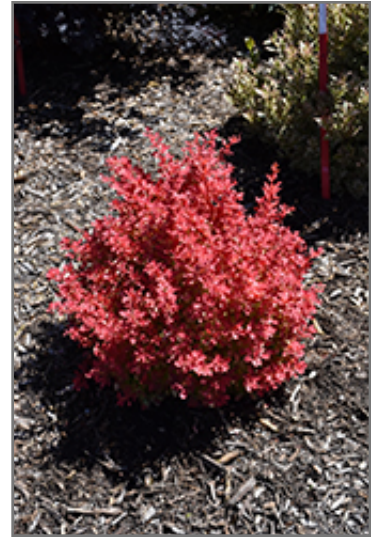
Sunjoy Neo Japanese Barberry

Sunjoy Neo Japanese Barberry makes a fine choice for the outdoor landscape, but it is also well-suited for use in outdoor pots and containers. It can be used either as 'filler' or as a 'thriller' in the 'spiller-thriller-filler' container combination, depending on the height and form of the other plants used in the container planting. It is even sizeable enough that it can be grown alone in a suitable container. Note that when grown in a container, it may not perform exactly as indicated on the tag - this is to be expected. Also note that when growing plants in outdoor containers and baskets, they may require more frequent waterings than they would in the yard or garden.