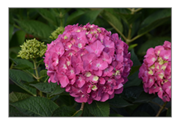
Let's Dance Arriba! Hydrangea flowers