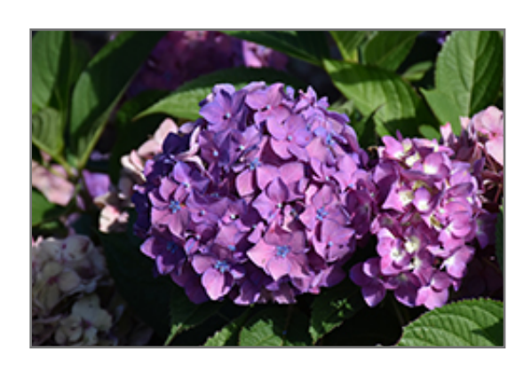
Let's Dance Arriba! Hydrangea flowers

Let's Dance Arriba! Hydrangea is recommended for the following landscape applications;