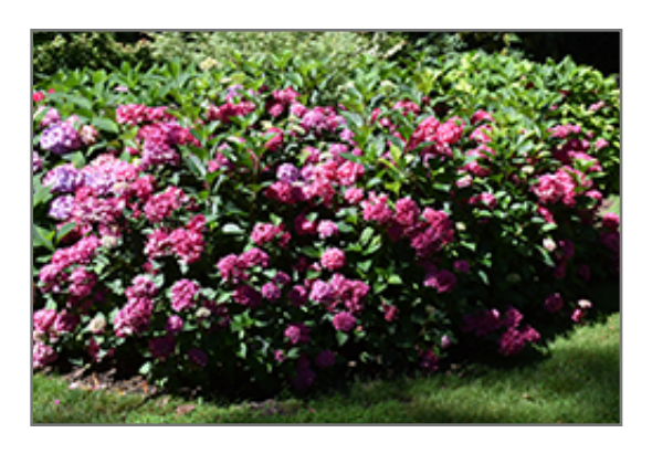
Let's Dance Arriba! Hydrangea in bloom

This shrub does best in full sun to partial shade. You may want to keep it away from hot, dry locations that receive direct afternoon sun or which get reflected sunlight, such as against the south side of a white wall. It requires an evenly moist well-drained soil for optimal growth. To help this plant achive its best flowering performance, periodically apply a flower-boosting fertilizer from early spring through into the active growing season. It is not particular as to soil type or pH. It is highly tolerant of urban pollution and will even thrive in inner city environments, and will benefit from being planted in a relatively sheltered location. Consider applying a thick mulch around the root zone in both summer and winter to conserve soil moisture and protect it in exposed locations or colder microclimates. This particular variety is an interspecific hybrid.