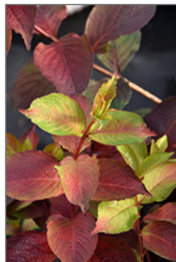
Midnight Sun Reblooming Weigela foliage