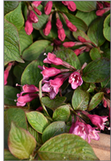
Midnight Sun Reblooming Weigela flowers

Midnight Sun Reblooming Weigela makes a fine choice for the outdoor landscape, but it is also well-suited for use in outdoor pots and containers. It is often used as a 'filler' in the 'spiller-thriller-filler' container combination, providing a mass of flowers and foliage against which the thriller plants stand out. Note that when grown in a container, it may not perform exactly as indicated on the tag - this is to be expected. Also note that when growing plants in outdoor containers and baskets, they may require more frequent waterings than they would in the yard or garden.