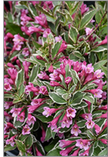
My Monet Purple Effect Weigela flowers

My Monet Purple Effect Weigela is recommended for the following landscape applications;