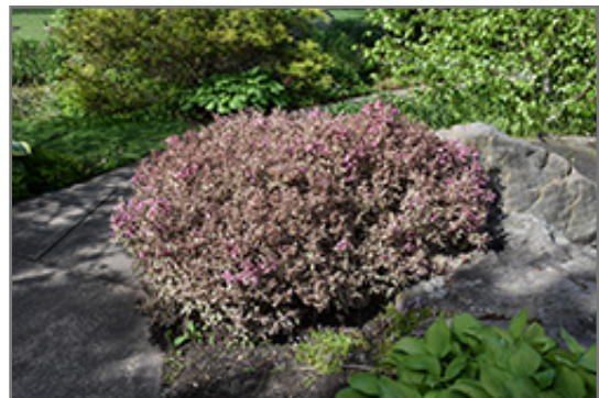
My Monet Purple Effect Weigela in bloom