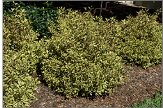
Bubbly Wine Weigela

Bubbly Wine Weigela will grow to be about 24 inches tall at maturity, with a spread of 3 feet. It tends to fill out right to the ground and therefore doesn't necessarily require facer plants in front. It grows at a medium rate, and under ideal conditions can be expected to live for approximately 30 years.