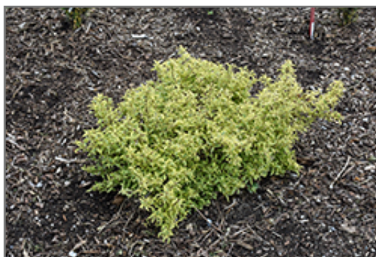
Bubbly Wine Weigela