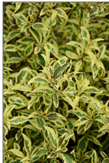
Bubbly Wine Weigela foliage

Bubbly Wine Weigela is recommended for the following landscape applications;