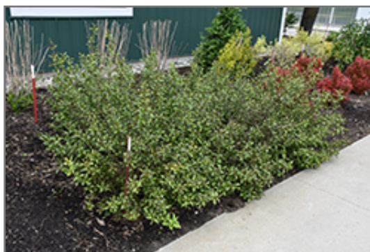
Vinho Verde Weigela