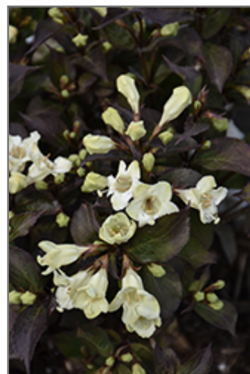
Wine & Spirits Weigela flowers