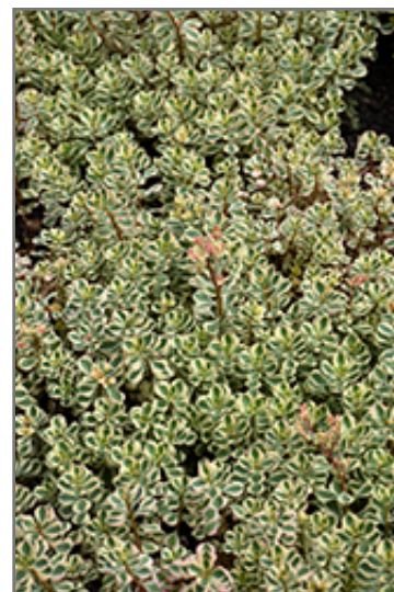
What A Doozie Stonecrop foliage

What A Doozie Stonecrop is recommended for the following landscape applications;