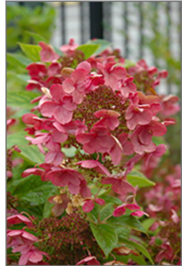
Quick Fire Hydrangea flowers (faded)

This shrub performs well in both full sun and full shade. It prefers to grow in average to moist conditions, and shouldn't be allowed to dry out. It is not particular as to soil type or pH. It is highly tolerant of urban pollution and will even thrive in inner city environments. Consider applying a thick mulch around the root zone in winter to protect it in exposed locations or colder microclimates. This is a selected variety of a species not originally from North America.